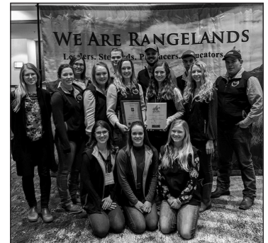
Range Team at the Society for Range Management conference in Denver, Colorado

On a normal year, most clubs would wrap up the term with an election meeting where a new set of executives for the upcoming school year would be voted upon. Although, given the premature University closure, it was common for clubs to have their nominations, biographies and voting all done electronically in order to maintain and ensure their success for the years ahead.