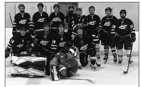
Clockwise from left - Oilers - A side trophy winners, B Winners College Two (scruffy looking bunch) and Comets - the C Winners.

Agriculture and Agri-food Canada has launched an online employment portal to provide links to resources for job seekers interested in working on farms, in distribution, food processing, and other related occupations. Resources include national and regional employment websites, and information on skills and training. AAFC's Step Up to the Plate – Help Feed Canadians encourages Canadians to step up to the plate in their community and seek out job opportunities in the agriculture and food sector. Posted on AAFC's Facebook, LinkedIn and Twitter, complemented by a media buy on both Facebook and Instagram. Our #CdnAgHeroes are at the front lines every day